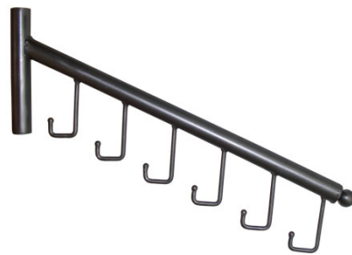
1 pcs – Arm